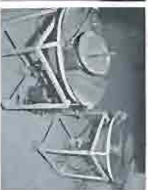
GLAZE TANKS, PUMPS & SCREENS