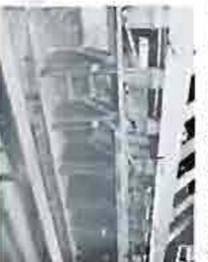
SPRAY GLAZING & FINISHING SYSTEMS