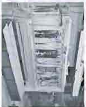
SPRAY GLAZING & FINISHING SYSTEMS