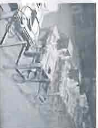
CERAMIC FINISHING MACHINES