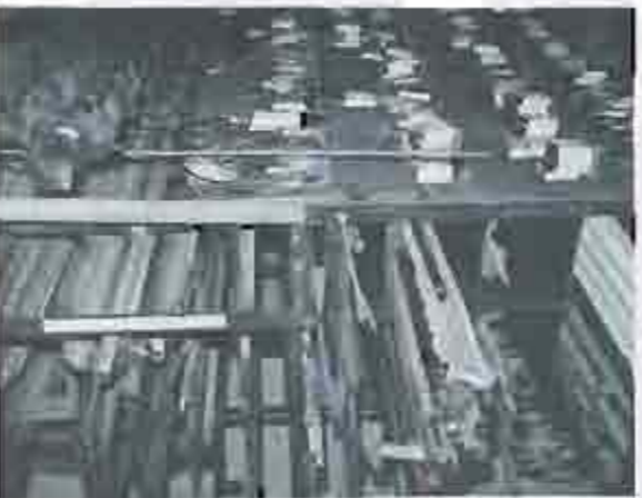
STEEL, PIPE, BELTS & OTHER STOCK