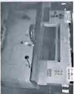
"CHALLENGER" PAPER CUTTER