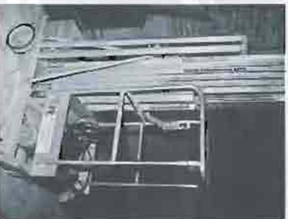
FORK, PALLET & MAN LIFTS