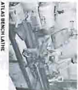
ATLAS BENCH LATHE