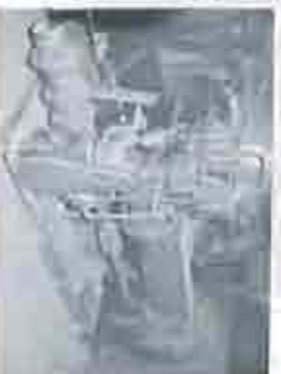
BONNET AUGER (pug mill) EXTRUDER