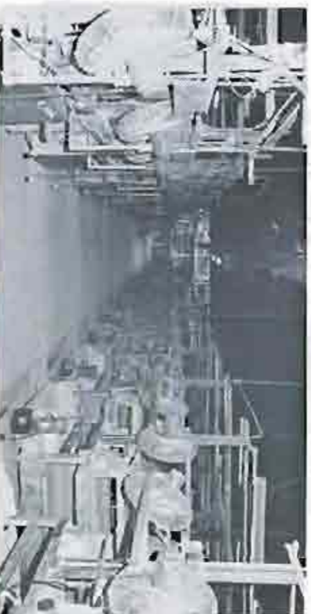
MODERN SLIP CAST LINES

Highly automated, well engineered and manufactured, slip casting lines to be sold by line 45 lines to be sold in consecutive order. A video tape is available from Mohr Corporation illustrating these slip casting lines in operation. Each line consists of two sides. Each side has mold racks in which molds are secured with inflated air bags during the automatic casting cycle. Cycle begins with automatic pouring of slip into mold, secondary re-fill to top if needed, drying, tipping of the mold for discharge of excess slip and returning the mold to the start position, deflating of the air bags and opening of the molds for product removal. The "systems" have adjustable timers and the speed of casting operation for each side is independently controlled and adjustable. Number of molds is versatile, volume of slip discharged into each mold automatically controlled by probes. Slip or other residue is removed from the center of the system by a common conveyor belt serving both sides of the line with a 44" wd x 44 1/2" lg belt, conveying material to recycle point. Overall length of each line is 35' x 5' wd x 50" hg to top of mold rack and 6' to top of slip dispenser. Each line can operate independently.