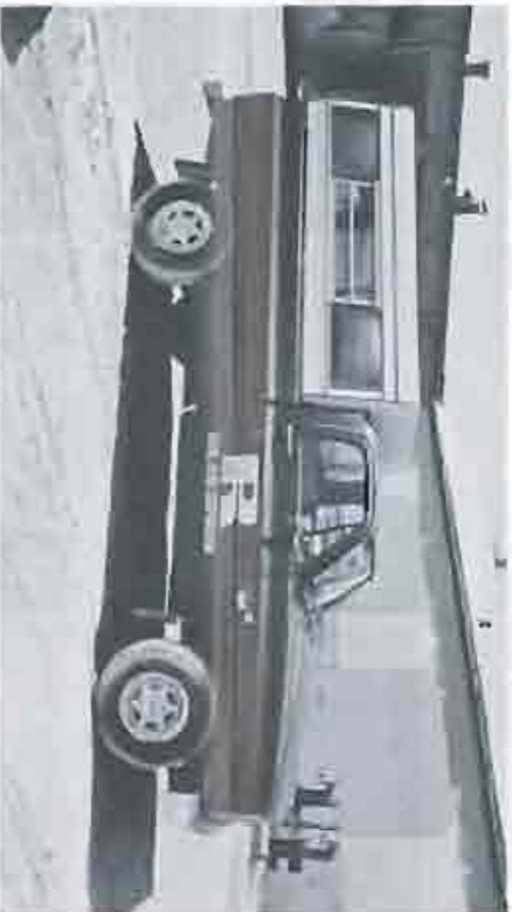
1983 GMC 3/4 TON DUMP TRUCK