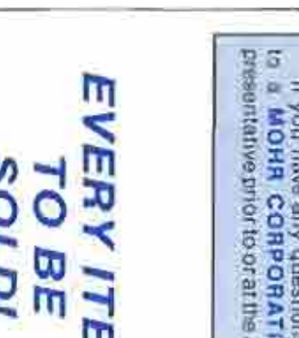
TANKS & AGITATORS