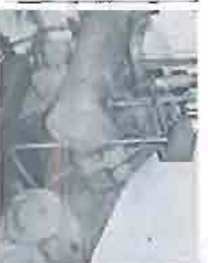
GARDNER-DENVER AIR COMPRESSORS "VAN-AIR" DELIQUESCENT AIR DRYER