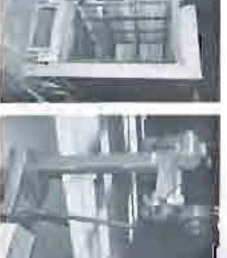
CERAM ELECTRIC KILN