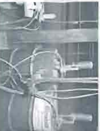
LOW DENSITY PACK, FOAM DISPENSER