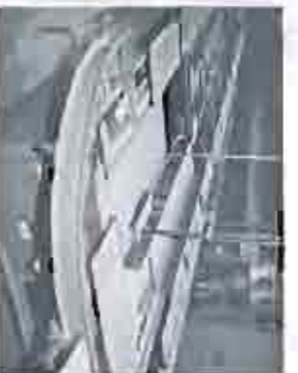
FACE SCREEN PRINTER