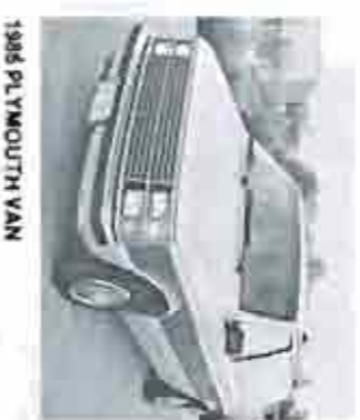
1985 PLYMOUTH VAN