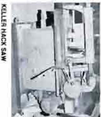
KELLER HACK SAW