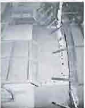
TANKS & AGITATORS (MANY)