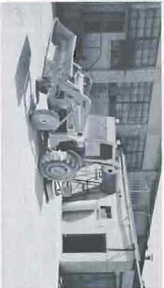
MASSEY FERGERSON FRONT END LOADER/TRACTOR