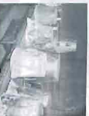
LOTS OF S.S. PAULS, BUCKETS, ETC.