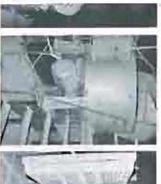
MIC MULLER MIXER SIMPSON

BONNOT • PAULO.ABBE • RUPP • "SANDPIPER" • GUINCY • WAHLCO •