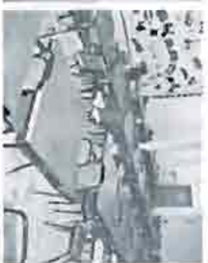
TURE & EQUIPMENT