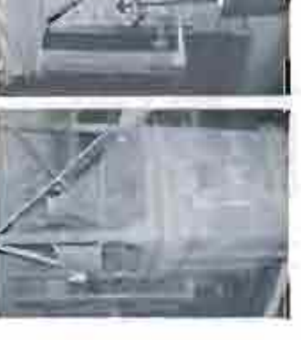
HOT STAMPING MACHINE