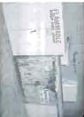
FLAMMABLE STORAGE CAB. & CONT.