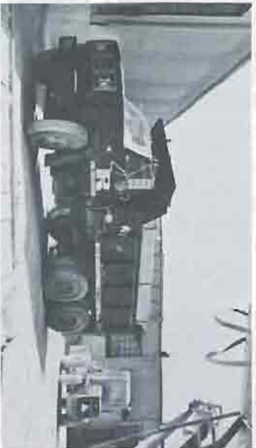
1985 GMC 10-TON DUMP TRUCK

GARDNER • DENVER • OMNIFAX • FRANTZ • MIDWESTERN • CERAM • WAHL • TOLEDO • MASSEY FERGUSON • SWECO • DeVILBISS • WAHL • BONNOT • PAUL O. ABBE • RUPP • "SANDPIPER" • QUINCY • WAHLCO • FERRO/TEMTEK • BINKS •