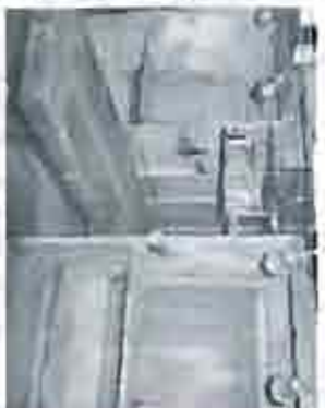
SPRAY GLAZING BOOTHS