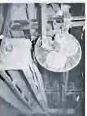
MODERN SLIP CAST LINES