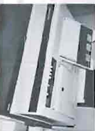
"OMNIFAX" — FAX MACHINE

INSIDE... MUCH, MUCH, MOHR OF PARTIAL LISTINGS FOR THE REGAL CHINA CORPORATION AUCTION... COME IN AND MAKE YOUR BID !!!