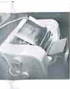
NETZCH 3-ROLL MILL (6' 9")