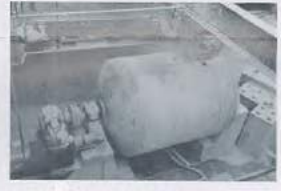
NETZSCH 5,00 AND 10,000 LITRE BALL MILLS