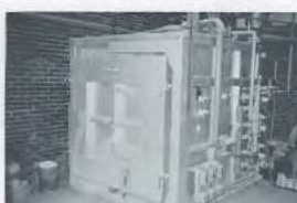
1-CU.M RIEDHAMMER KILN