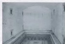
FIBRE LINED SHUTTLE KILN