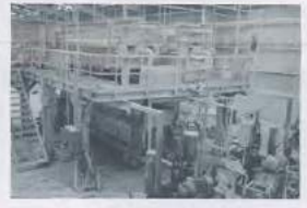
NETZSCH CLAY PLANTS