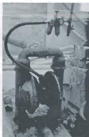
MANY DIAPHRAM PUMPS

ONLY A SAMPLE OF THE EXTENSIVE AMOUNT OF MODERN MACHINERY TO BE SOLD IS ILLUSTRATED.