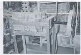
LAB FILTER PRESS