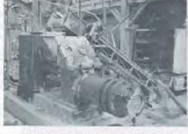
DEAIRING PUG MILL EXTRUDERS