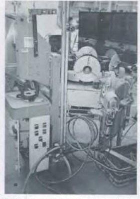
MALKIN DECORATING MACHINES