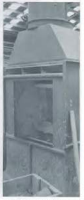
SPRAY GLAZE BOOT

• DECORATING EQUIPMENT • JIGGERING SYSTEMS & EQUIPMENT • SHUTTLE AND BATCH KILNS • TUNNEL AND SLED TYPE KILNS