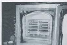
1-CU.M RIEDHAMMER KILN 3,000 ° F.