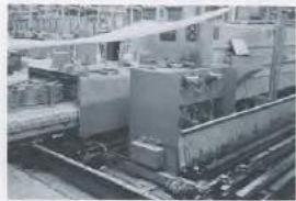
RIEDHAMMER & OTHER SLED KILNS