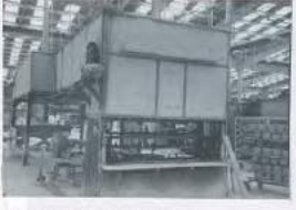
MANGEL TYPE DRYERS