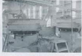
SWECO SCREEN SEPARATORS