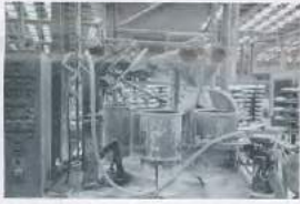
AUTOMATED SLIP CASTING SYSTEMS