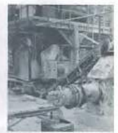
NETZSCH DEAIRING PUG