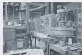
NETZSCH JIGGERING SYSTEMS