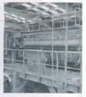
NETZSCH FILTER PRESSES II