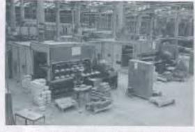
MANY COMPLETE JIGGERING SYSTEMS