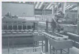
JIGGERING SYSTEMS WITH DRYERS