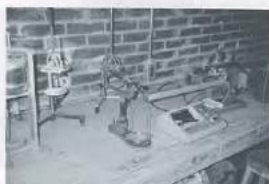
LAB & Q.C. EQUIPMENT