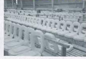
SLIP CASTING EQUIPMENT