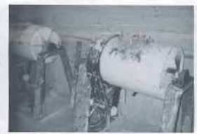
LAB SIZE BALL/PEBBLE MILLS