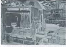
SPRAY GLAZE BOOTHS