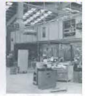
MANGEL TYPE & M