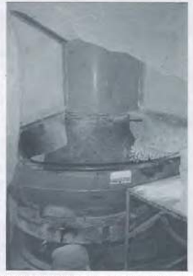
VIBRATORY FINISHING MACHINE