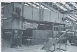
NETZSCH MANGEL TYPE DRYERS