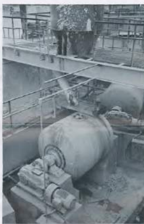
NETZSCH - 5,000 TON & 10,000 LITRE BALL MILLS.

SALE STARTS MONDAY, JANUARY 24, 1994 8:00 a.m. — DON'T MISS IT!