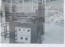
90 TON RAM PRESS