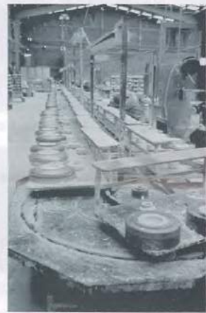
SLIP CASTING EQUIPMENT