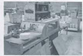
BOULTON MARKING MACHINE