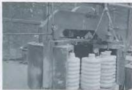
HANDLE CASTING SYSTEMS