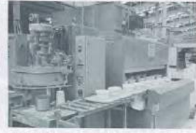
NETZSCH JIGGERING SYSTEMS