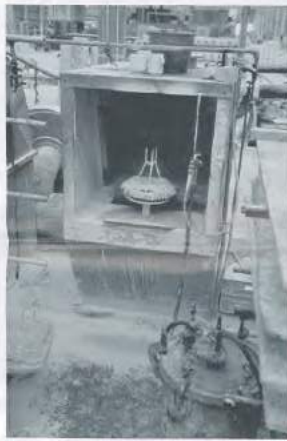
SPRAY GLAZE EQUIPMENT

These photos illustrate only a small part of the equipment and systems to be sold in this liquidation. A complete listing of the lots being sold will be available on site on January 24th. Please look inside for more illustrations that are to be sold in this very large and modern facility . . .