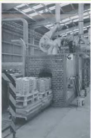
TUNNEL KILNS & REFRACTORY

These photos illustrate only a small part of the equipment and systems to be sold in this liquidation. A complete listing of the lots being sold will be available on site on January 24th. Please look inside for more illustrations that are to be sold in this very large and modern facility . . .