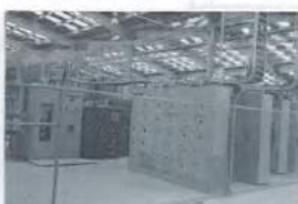
HEAVY ELECTRICAL EQUIPMENT