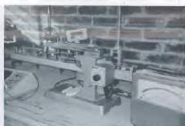
LAB SCALES & EQUIPMENT