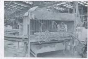
NETZSCH SPRAY GLAZE SYSTEM