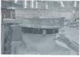
SWECO SCREEN SEPARATORS