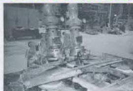
2-HEAD JIGGERING MACHINES