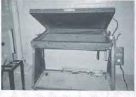
DECAL MAKING EQUIPMENT