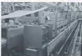
RIEDHAMMER SLED KILN