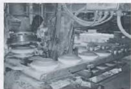
COMPLETE JIGGERING SYSTEMS