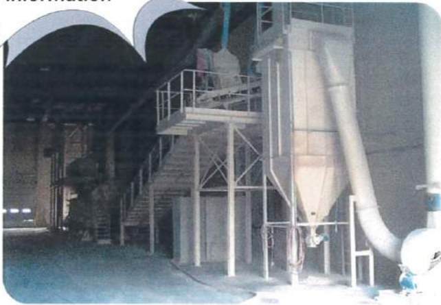
Raw Material Handling