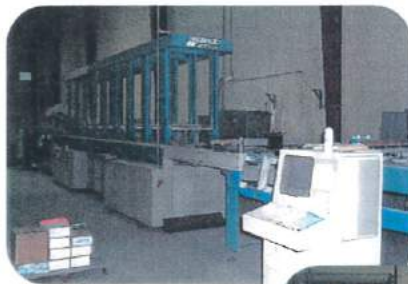
Tile packaging system