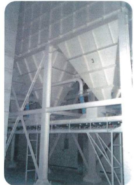
Raw Material Storage