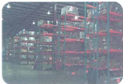
Large warehousing space