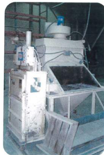
Bag dump station

The only facility of its type offered anywhere!