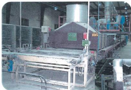
Roller hearth kilns