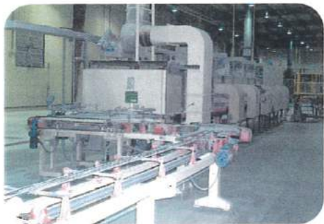
Roller hearth kilns