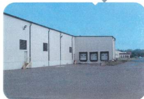
Loading docks plus grade level doors

Absolutely ideal location in the U.S.A.!