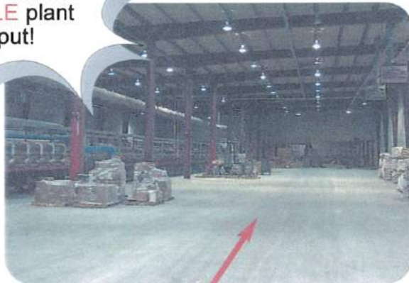
Room for 2nd kiln

Addition of a second kiln will DOUBLE plant output!