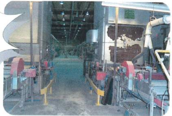
Pressed Tile Dryers

Photos in this presentation are just to give a partial view.