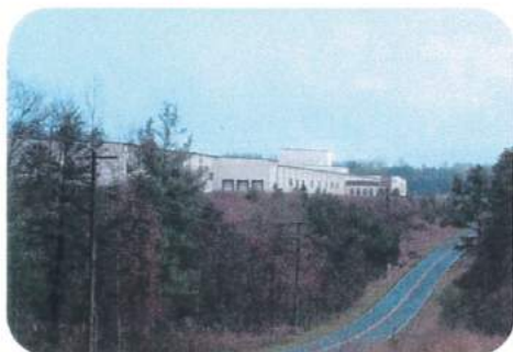
Desirable industrial park location

This plant can produce economically in the U.S.A.