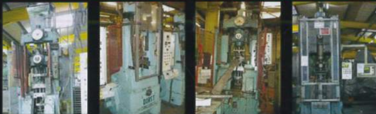
30 TON MODEL TPA-30